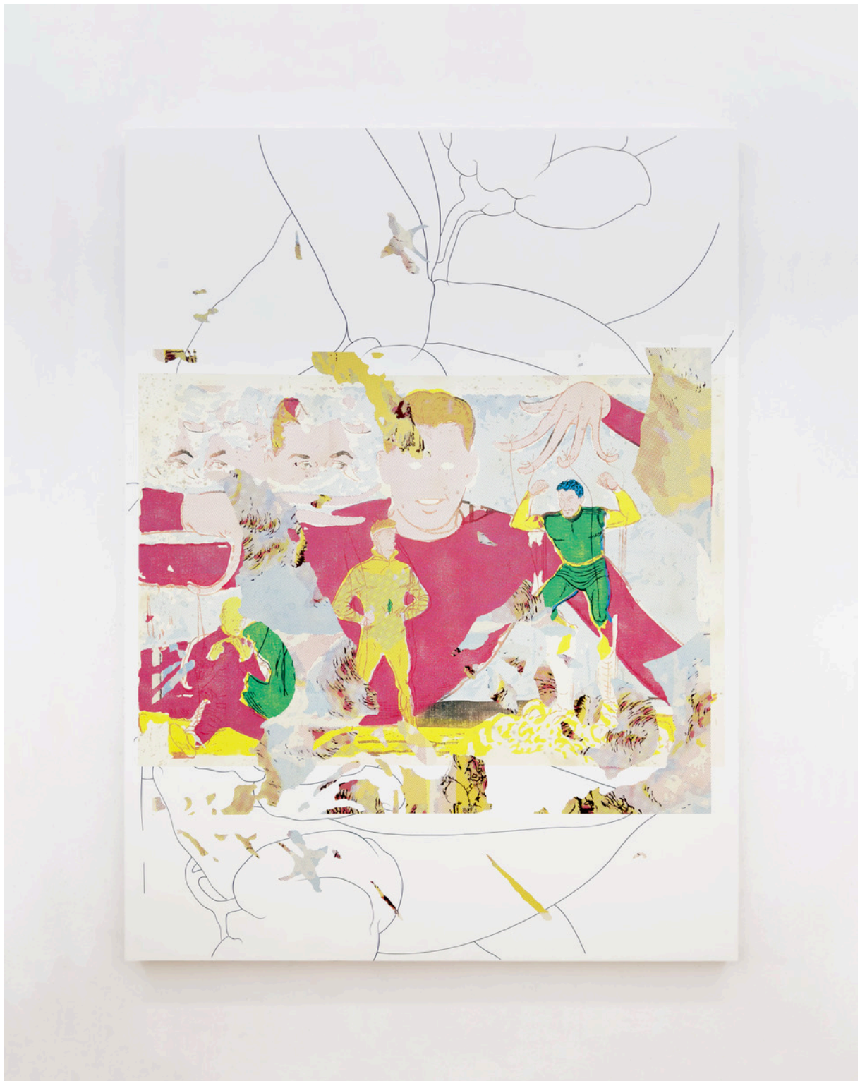
GATEKEEPER, 2024 acrylic on canvas, 130 x 180 cm