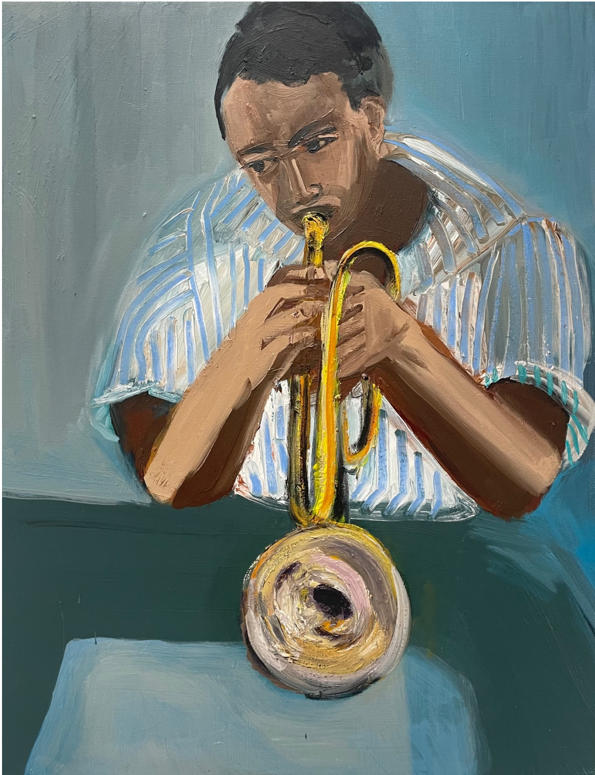
Thad Jones, 1955, 2023 Oil on canvas, 71 x 56 cm 4900 € + VAT