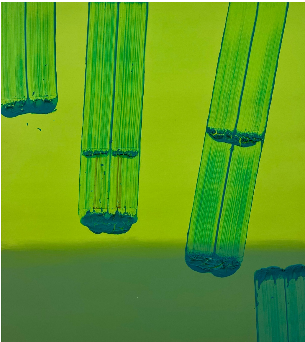
Stroke 5, medium, 2022, 120 x 109 cm acrylic, oil and wax on canvas 5500 € + VAT