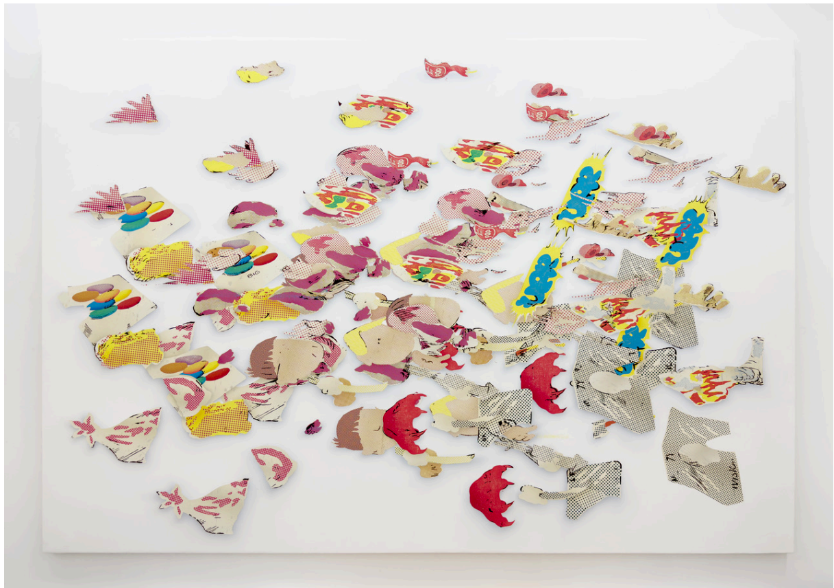
REMINERS, 2024 acrylic con canvas, 220 x 150 cm

Visual artist whose research is grounded in various references, initially exploring identities reflected in children's icons, comics, press photographs, and other elements of the collective imagination. This exploration involves an interpretive process that reflects an observed obsession, translating into meticulous care for each image, element, or discovery. His artistic production is centered on generating powerful interpretive stimuli with high technical elaboration, emphasizing the meticulous construction of projects. He studied Art and Design in Caracas in 2010, later advancing his skills in screen printing, drawing, and painting in New York City in 2014.