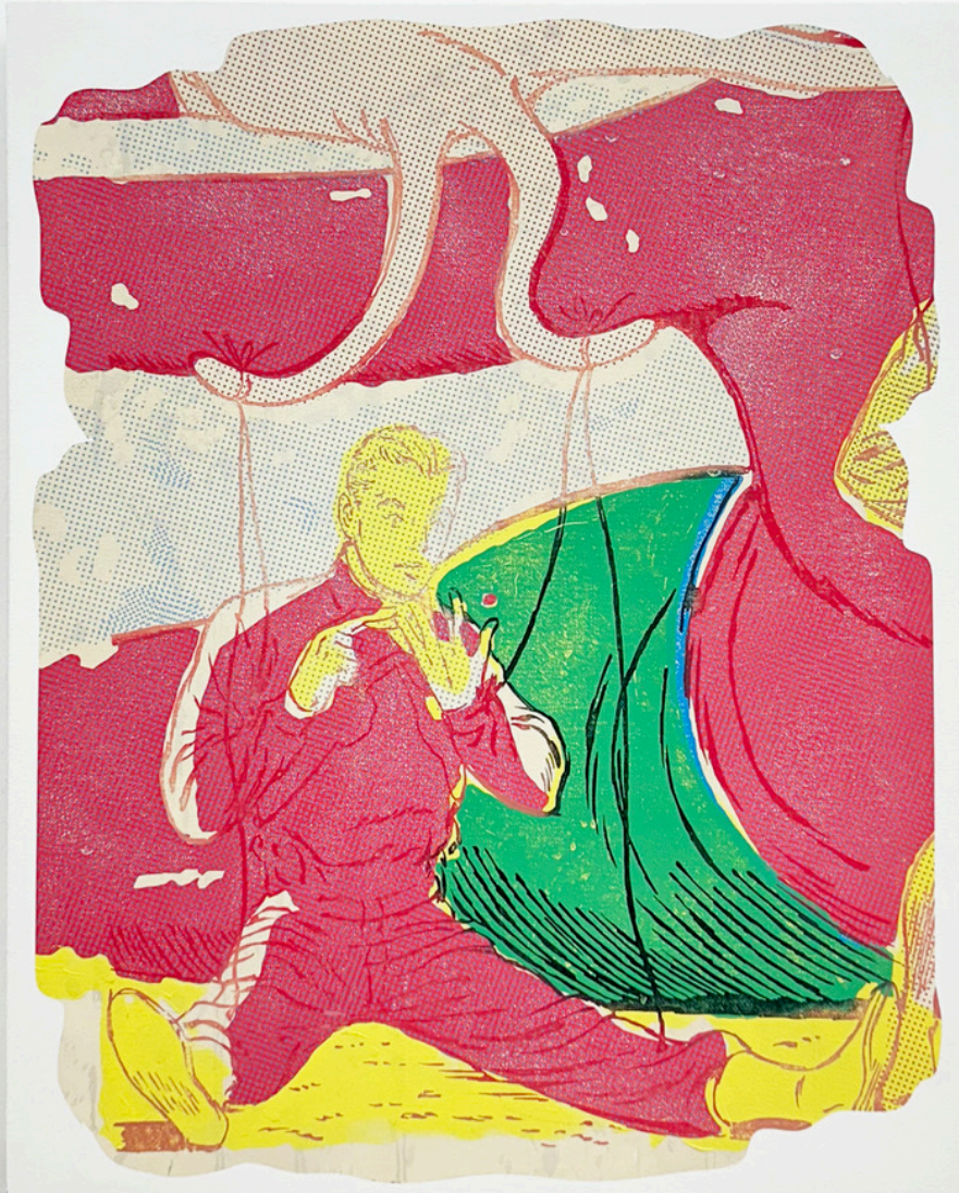
QUORUM, 2024 acrylic on canvas, 45 x 56 cm