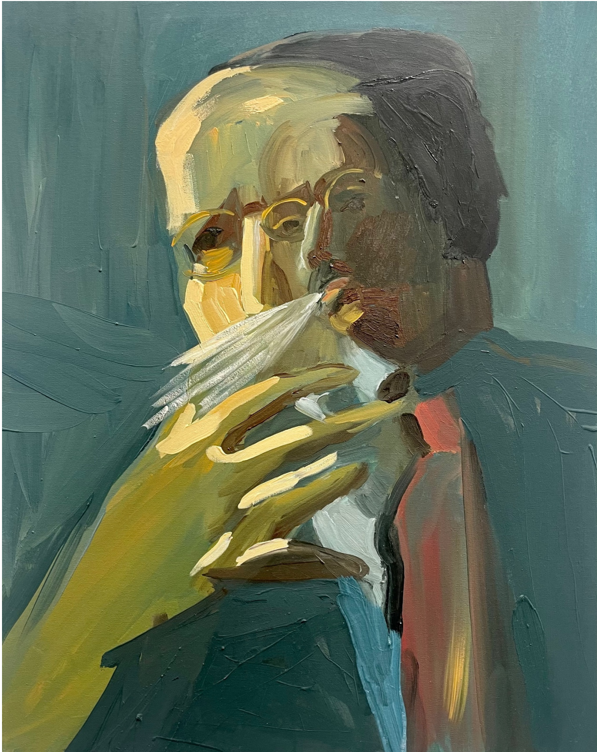
Mark Rothko c. 1950, 2023 Oil on canvas, 77 x 61 cm 5500 € + VAT