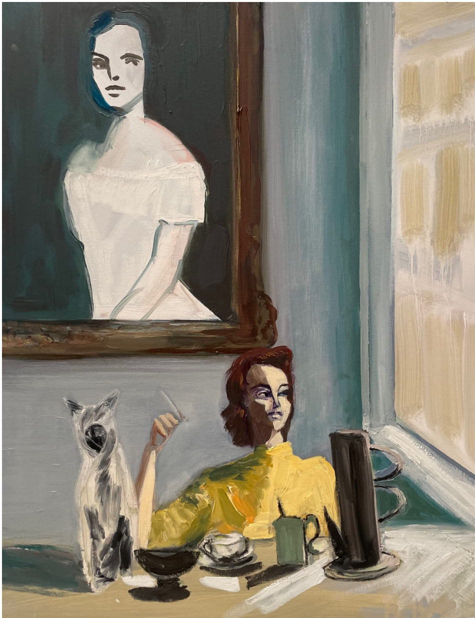
Lois Long c. 1955, 2023 Oil on canvas, 71 x 56 cm 4900 € + VAT